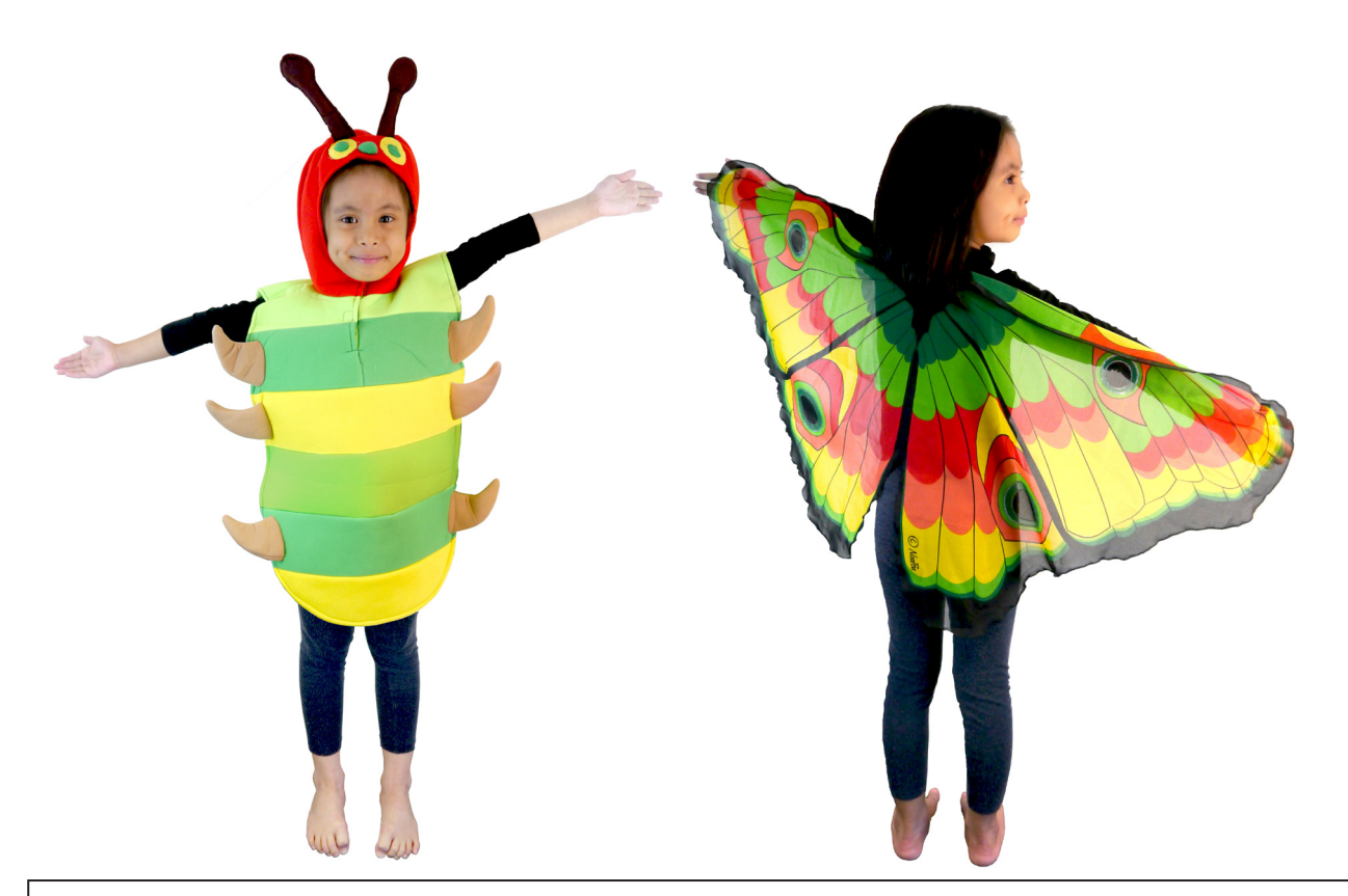
N.B. A read-aloud story of 'Flutterpillar' features on the enhanced CD, to help you introduce the story to the children before rehearsals begin.

But then Badger comes back, knowing that it's time for Flutterpillar to wake up. Flutterpillar has to squiggle and squirm and push and pull to get out of her chrysalis. When she manages to break free, she stretches and out come her two wings. She has turned into a butterfly! Her dream has come true.